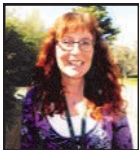
Kim Absalom Ashby Children's Centre